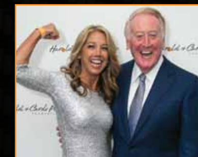
Denise Austin and Vin Scully