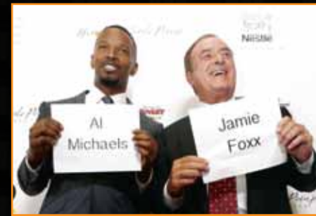
Jamie Foxx and Al Michaels