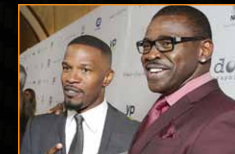
Jamie Foxx and Michael Irvin