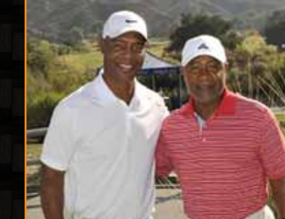
Marcus Allen and Ozzie Smith