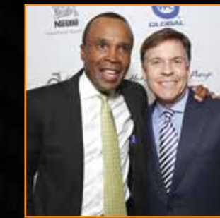
Sugar Ray Leonard and sportscaster Bob Costas