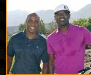
Barry Bonds and Brian McKnight