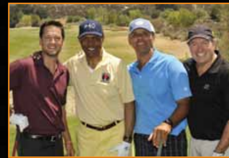
Gale Sayers with Golfers

Also, through the support of the Harold & Carole Pump Foundation, a Leipzig applicator system was purchased to treat skin and other type cancers. This device has led to more efficient use of staff time, greater patient satisfaction, better clinical outcomes and fewer side effects for patients.