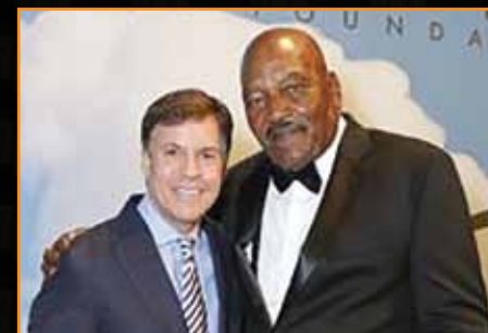
Bob Costas and Jim Brown